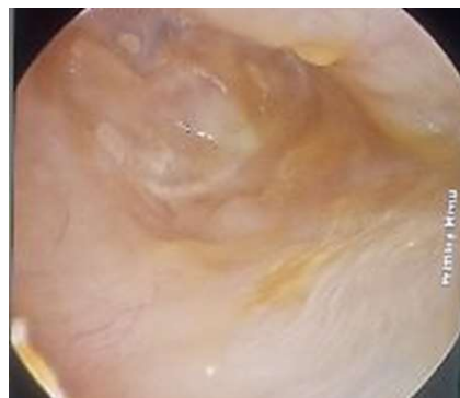
Figure (4): Healed TM a month and a half postoperatively 3. Statistical analysis: The gathered information was coded, arranged, and factually broke down utilizing theSPSS program (Statistical Package for Social Sciences) programming form 25.Descriptive statistics were done for parametric

The patients in this investigation were assessed based on postoperative unite taking, hearing improvement, and intricacies. The effective conclusion of the hole was characterized as a flawless TM at 3 months postoperatively. Accomplishment as far as the hearing was characterized as an improvement of 10 dB or more prominent at 3 months.