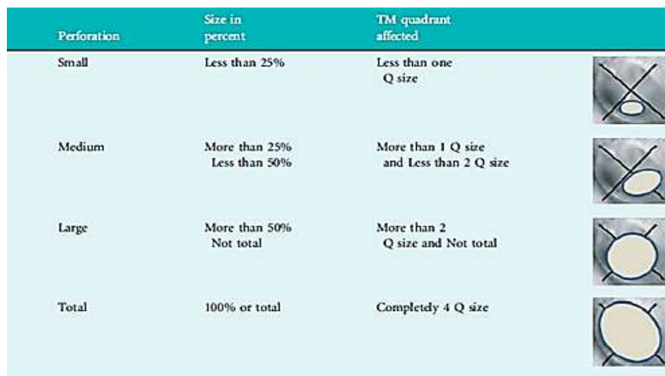
Figure (1): Perforation size subdivision based on the four tympanic membrane quadrant size (Saliba's subdivision). Q=quadrant

2.1. Preparation of autologous PRP: During acceptance of sedation and initial steps of medical procedure, 10 ml of fringe venous blood was drawn from the patient with a 10 ml needle to evade aggravation and harm of the platelets; at that point gathered blood was kept in a 5 ml plain vacuum cylinders, and afterward the cylinders were quickly centrifuged utilizing a tabletop rotator machine lastly the temperature of the centrifugation was kept at 20° C to 24°C.