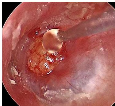
Figure (3): PRP on fat graft The outer ear is packed with fragments of gelfoam in both classes, and the outer ear opening is covered with a merocel ear pack. The coating was left for 1 week over the treated ear. 2.3.-2.3. Preoperative follow-up: systemic antibiotics, decongestant and non-steroidal anti-inflammatory agents of a wide spectrum were identified for 1 week. After 1 week, the package and stitches were removed, and antibiotics ear drops were recommended for 2 weeks after the outer ear band was removed. The patients were monitored for 1 month at time points and for 3 months at months follow-up.

The patients in this investigation were assessed based on postoperative unite taking, hearing improvement, and intricacies. The effective conclusion of the hole was characterized as a flawless TM at 3 months postoperatively. Accomplishment as far as the hearing was characterized as an improvement of 10 dB or more prominent at 3 months.