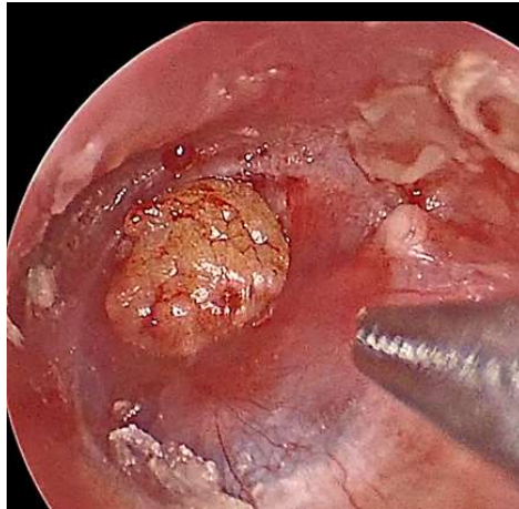
Figure (2): Fat join to set up In bunch A: No PRP is added to the united. In group B: Before and after placing and adjusting the graft in its place, PRP is applied on fat graft and gel foam in the middle ear and EAC.